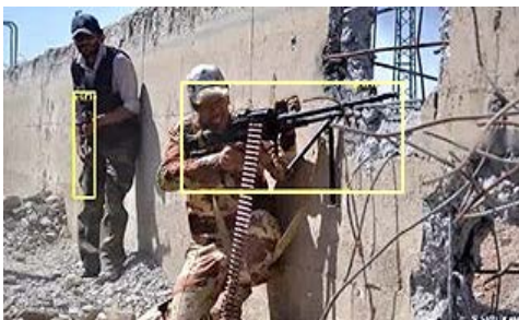
Strategic intelligence / Counter terrorism