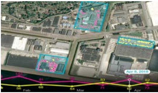
Automatic Target Recognition