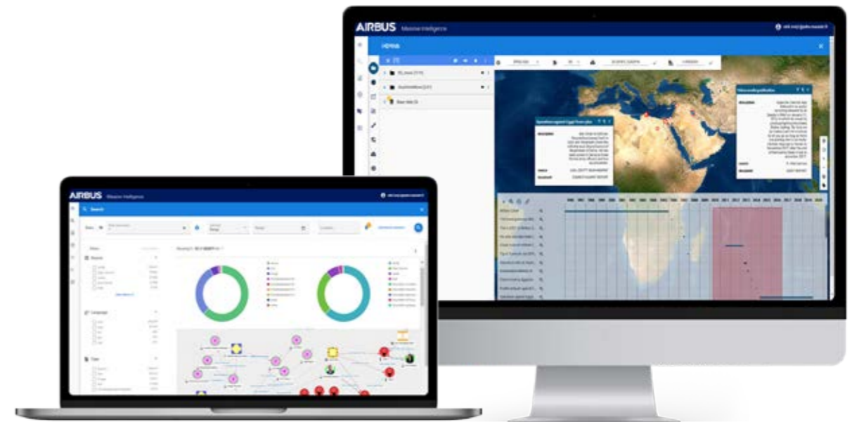
Dashboards and relational graph