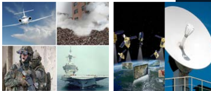
Multi-INT and IMINT GEOINT centers

Airbus Defence and Space Australia, Brazil, China, Finland, France, Germany, Hungary, Singapore, Spain, United Kingdom, United States